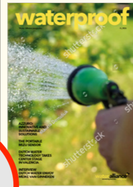
WaterProof magazine #01, 2026

WaterProof is the magazine of the Water Alliance, a partnership between government, research institutions and industry in the field of innovative and sustainable water technology. From its base, the WaterCampus in Leeuwarden, the Water Alliance builds on the 'water technology innovation chain'; a process whereby new ideas from universities, laboratories and test sites are converted into worldwide marketable products. WaterProof provides regional, national and global information on developments, results and background in the field of water technology.