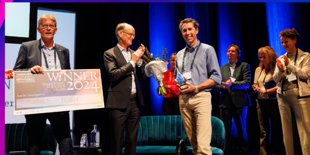
Two previous winners of the WIS Award: FerrTech (top) and Bubble Flush

standing right at that door. In that case the award can give you exactly the push you need to accelerate your success.”